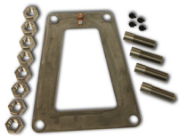
New Construction Jig with Anchors 500-5000A

Due to printing technology actual color may differ.