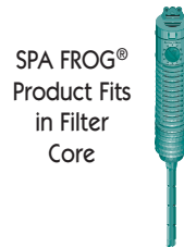
SPA FROG® Product Fits in Filter Core

KING TECHNOLOGY, INC. 952-933-6118 www.kingtechnology.com