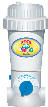
POOL FROG® IN GROUND CYCLER