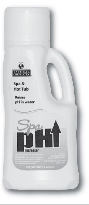
<u>Note:</u> NCI threaded cap = 2 tsp or 1/2oz